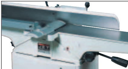
Jointing fence tilts \pm 45^\circ – for maximum protection, also when cutting chamfers