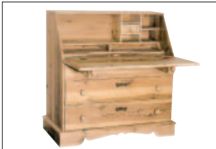
Cutting possible up to a width of 200 mm