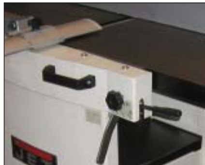
Eccentric rapid adjustment of the jointer tables