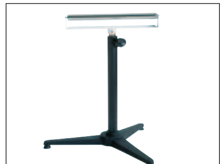
Helping stand for simple machining of long workpieces