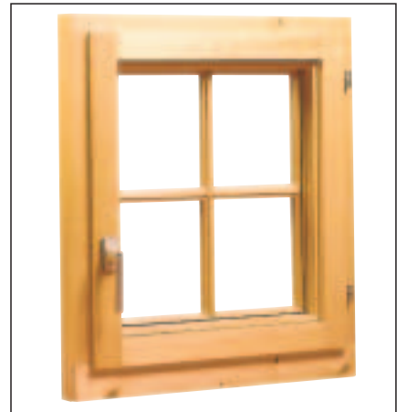
Clean surfaces due to 3-knife cutter head