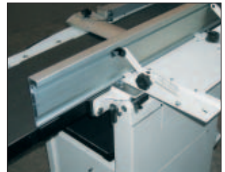
Double guided jointing fence, tilts at the table