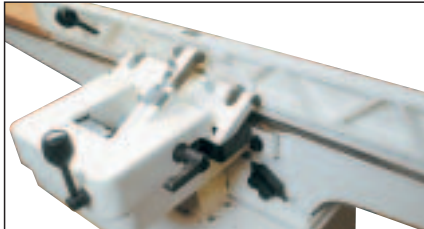
Easy-to-operate cast iron jointing fence