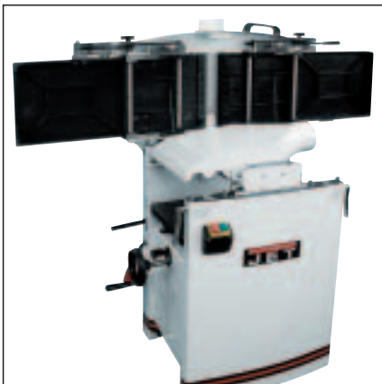
Rapid change from planing to thicknessing